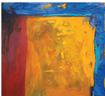
30" x 30" Roger Lafreniere original artwork "Energy" acrylic on canvas!